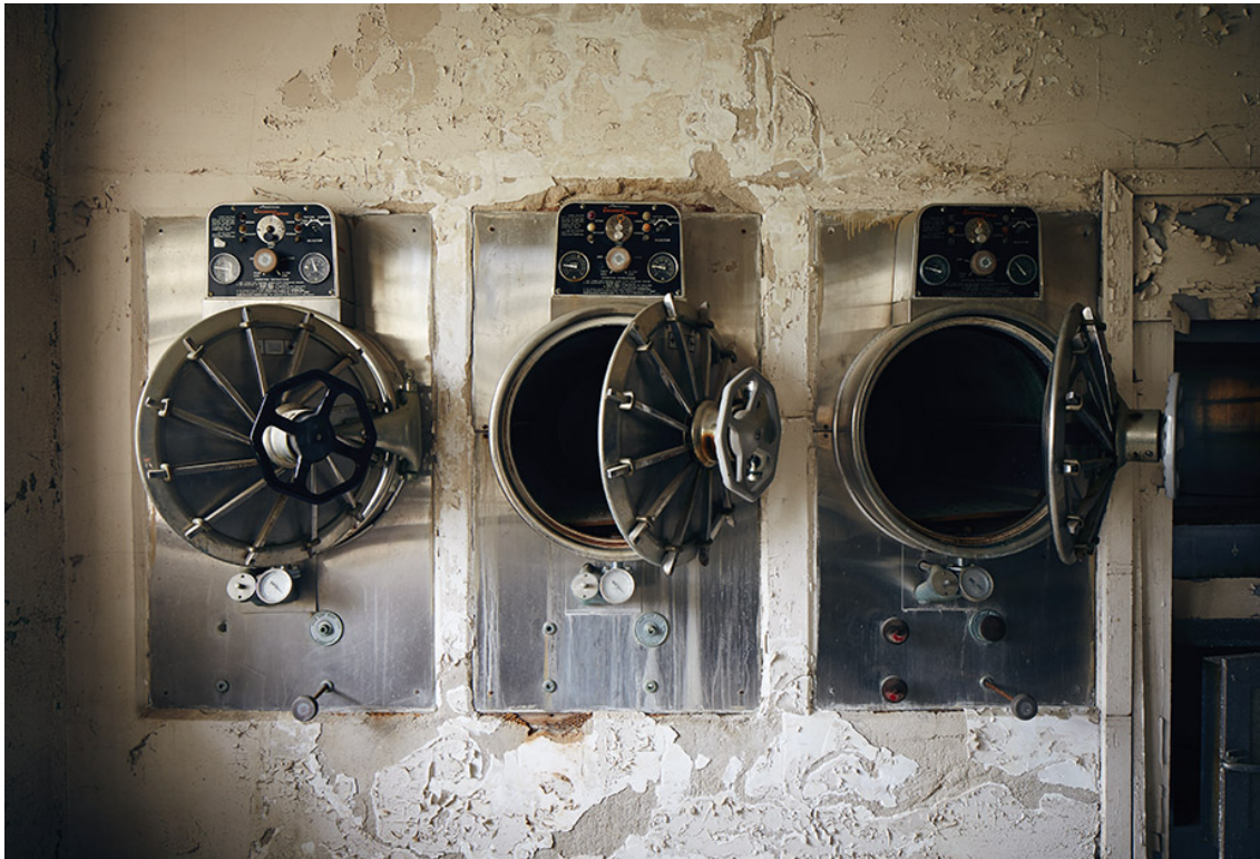
The Jones Building served as a general hospital, offering medical care to patients at Central State as well as residents of Milledgeville and the surrounding area. Wheeled doors that look as if they belong on a submarine were part of the machinery used to steam and sterilize equipment and garments.