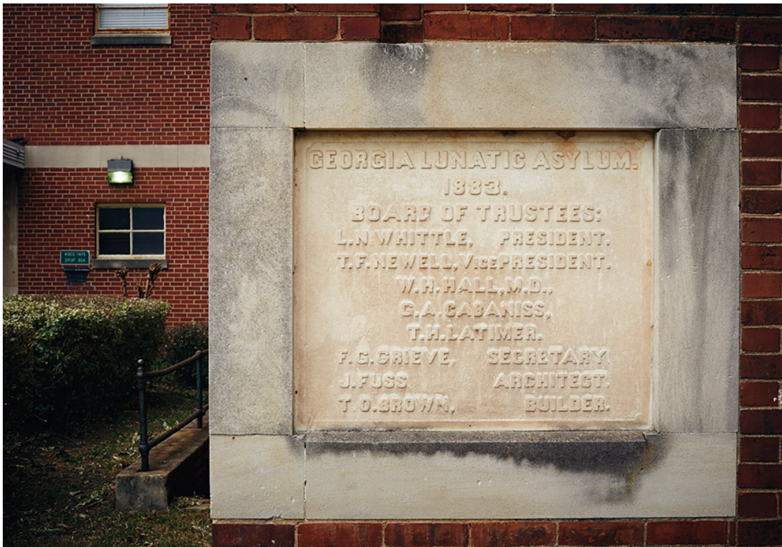
A marble marker commemorates the asylum's origins.