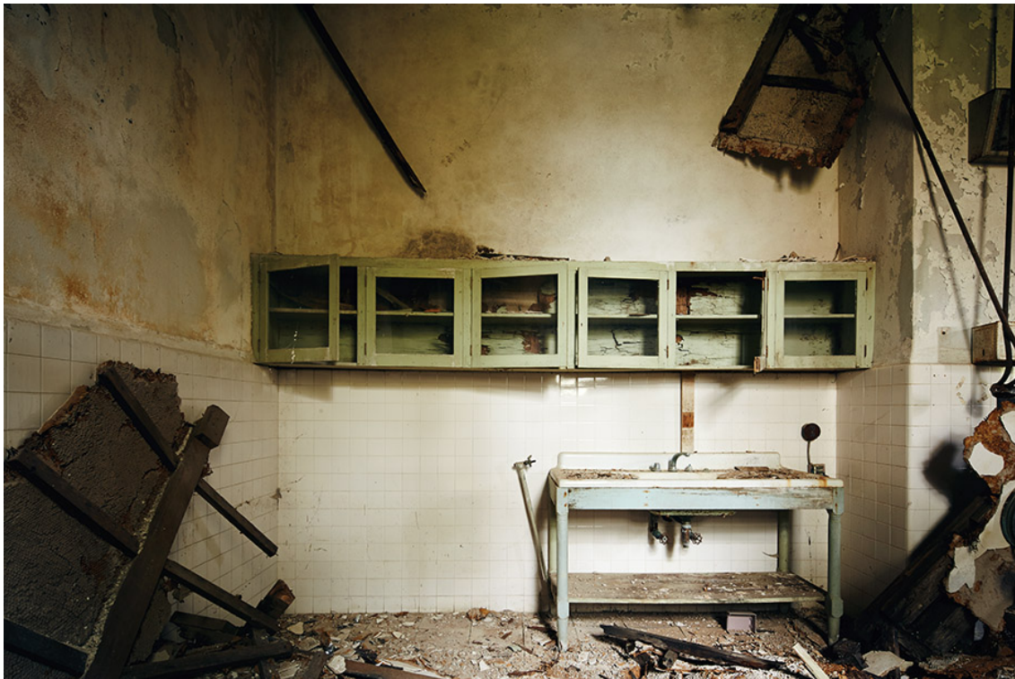
Advocates for redevelopment hope to preserve the Jones Building. Campus caretakers sometimes find dead foxes and hawks in the abandoned buildings. Birds fly in and out of open windows.