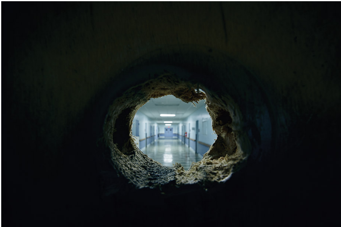
Most of the Powell Building is now empty, including treatment rooms and rooms that once housed patients.